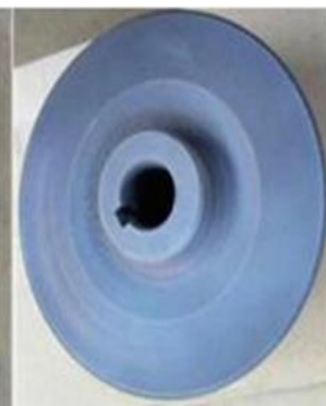
[4] superhydrophobic impeller