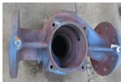
[2] Sample with hydrophobic coating