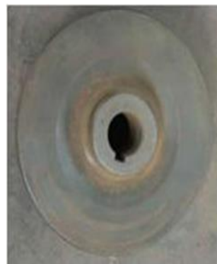
[3] original impeller