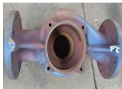
[1] Original sample

paramagnetic-antiferromagnetic transition and antiferromagnetic-canted antiferromagnetic transition.