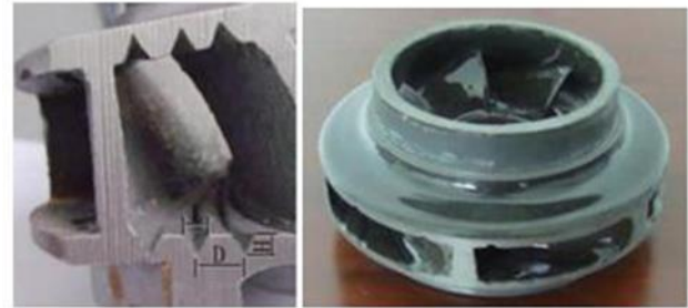
[4] Bionic groove

pressure and flow field is only predicted and obtained to achieve the bionic volute vibration noise reduction function. In the hydraulic design of volute centrifugal pump, the analysis showed that the bionic volute could long-eared owl non-smooth morphology has been adapted to reduce the pressure pulsation amplitude significantly.